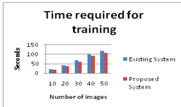
Fig 2: Time required for training images

Experimental result shows that the time required for training of images in our proposed system is less than time required for training in existing system.