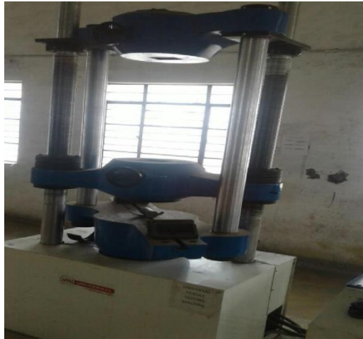
Fig No 4: Front view of UTM Equipment for compression test Woven brake liner