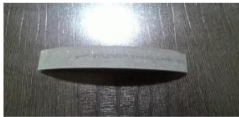
Fig 1:Moulded Brake Liner

3.1.3 MECHANICAL PROPERTIES Specific Gravity (SAE J380) : 1.87 Gogan Hardness (SAE J379A) : 18 Tensile Strength, PSI (ASTM D638) : 3300min Impact Resistance (ft-lb/inch 2 ) : 2.3 FRictional PROPERTIES Coefficient of Friction (SAE J661): Normal : 0.15 Hot : 0.15 Wear Rate (SAE J661) (inch 3 /hp-hr): 0.002max Maximum Operating Limits