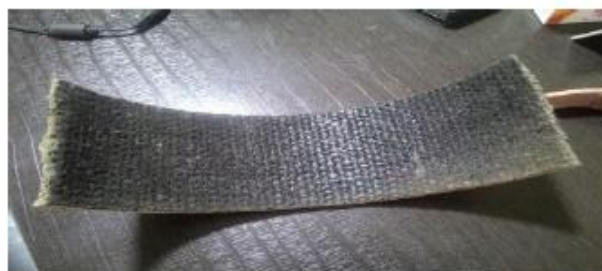
Fig:2 Woven brake Liner

3.2.2 CHARACTERISTICS: Uniform friction Non-abrasive Premium life characteristics High tensile strength.