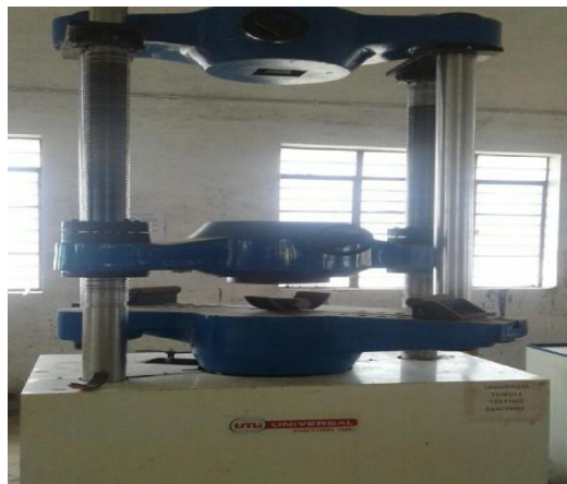
Fig.No.3:Front view of UTM Equipment for compression test Moulded brake liner

1. The compression test can be carried out on any hydraulic press. The easily available press for us is universal testing machine. 2. The initial thickness of liner is measured. 3. The specimen is kept on machine table. 4. The steel round is placed on material. 5. The ram is lowered with the help of lead screw motion. 6. Hydraulic power pack is turned on. 7. The force applied on the liner is kept constant for 3 hours. 8. After 3 hours, the thickness of liner is measured.