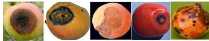
Figure 2: Anthracnose diseased fruits (a) Apple (b) Mango (c) Orange (d) Tomato (e) Pomegranate

The below figures are some of the example of the defected fruits